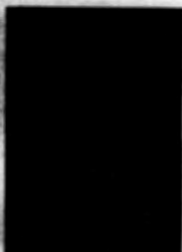
1577-41 Detail from the painting The Last Judgment , Michelangelo