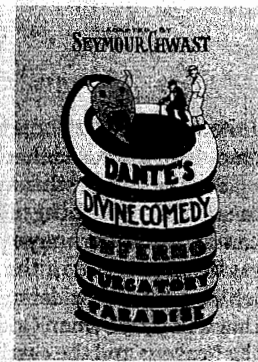
2010 Dante's Divine Comedy , artist Seymour Chwast's first graphic novel

who profess Jesus as Lord, and they—and they alone—will be reconciled to God. Such views cannot be dismissed because they are inconvenient or uncomfortable: they are based on the same Bible that liberals use to make the opposite case. This is one reason religious debate can seem a wilderness of mirrors, an old CIA phrase describing the bewildering world of counterintelligence.