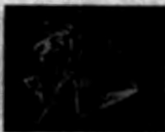
1440 Detail from the manuscript The Hours of Catherine of Cleves